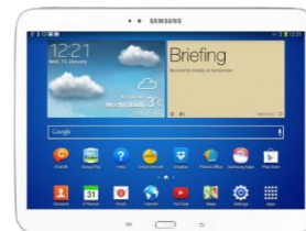
Your device anywhere