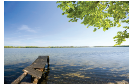
Furesø was around 1900 one of Northern Europe’s cleanest and most species-rich lakes.

Flexibility, usability and security are the core elements of G/On and these are our highest priorities, so G/On is the exactly right solution for us, “concludes Erling Jepsen, CIO at Furesø Municipality.