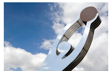
One of the municipality’s fine sculptures